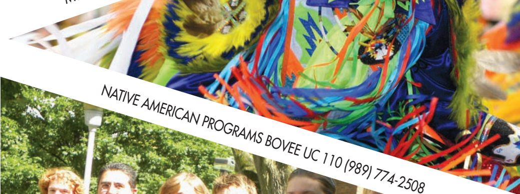
NATIVE AMERICAN PROGRAMS BOVEE UC 110 (989) 774-2508