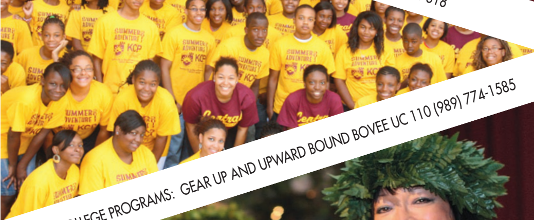
PRE-COLLEGE PROGRAMS: GEAR UP AND UPWARD BOUND BOVEE UC 110 (989) 774-1585