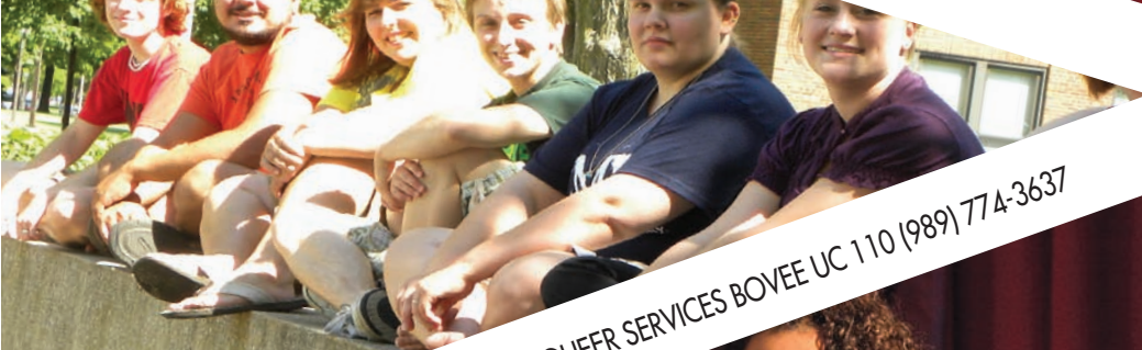
LESBIAN GAY BISEXUAL TRANSGENDER QUEER SERVICES BOVEE UC 110 (989) 774-3637